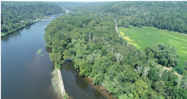
THE DELAWARE RIVER and D&R CANAL at BULLS ISLAND on the D&R FEEDER CANAL from the air by drone