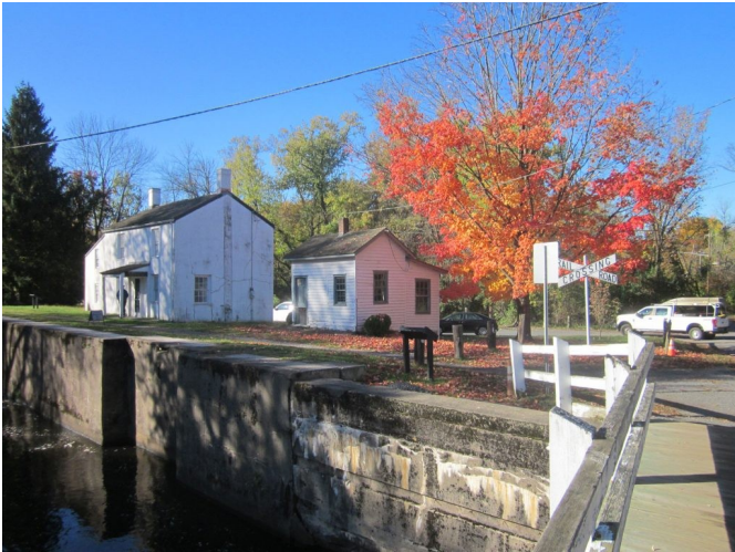
D&R CANAL, KINGSTON LOCK-TENDER'S HOUSE – headquarters of KHS

KHS Participated in several 50 th Anniversary Events