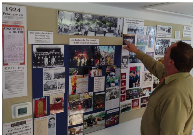
Exhibit - 100 years of Volunteers - KVFC

The focus of the exhibit was on "People" – the members of the Company who have kept the community safe for 100 years.