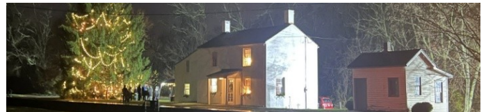
Annual Tree Lighting 2023