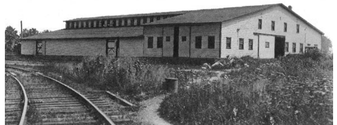
BARE ROOT STORAGE and SHIPPING BUILDINGS (c. 1920)

The former root storage building was replaced with a masonry structure, but the Shipping Building still stands.