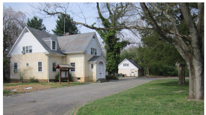
D&R CANAL STATE PARK HEADQUARTERS (2013)

The Mapleton Preserve Commission, a joint South Brunswick Township and State of New Jersey DEP Commission, has oversight over the Mapleton Preserve.