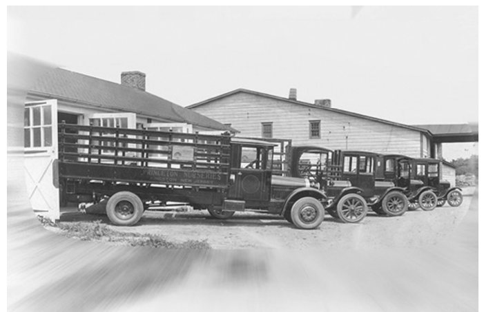
PRINCETON NURSERIES TRUCK FLEET (c. 1920)

In 1930 F&F Nurseries in Springfield and Princeton Nurseries became two separate entities; although for many years the two sites had already been run quite independently.