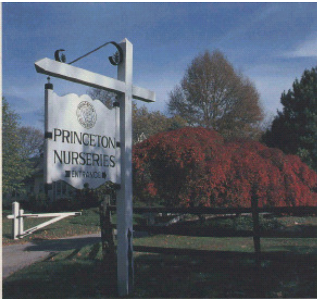
ENTRANCE TO PRINCETON NURSERIES (1970s)