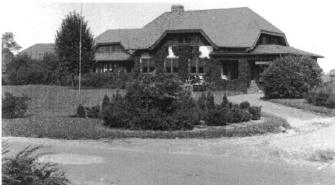
PRINCETON NURSERIES MAIN OFFICE (c. 1918)